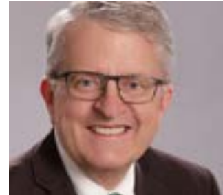
Oakville Mayor Rob Burton